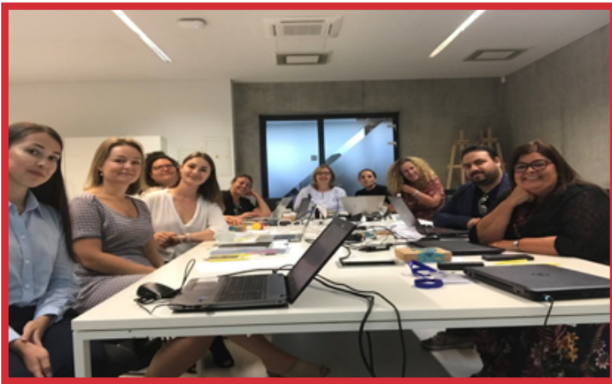
The third transnational partner meeting was held on the 29th of August 2019 in Kaunas, Lithuania.

The meeting started with a thorough update of project activities. Particularly, the partners discussed the finalization of the content for the Next Generation Women Technology Entrepreneurs Curriculum and the Digital & Social Media Literacy Curriculum. KAUNAS STP presented the value proposition for the In-service training and all partners agreed on its development approach and set a timeline for the development process. Finally, the partnership reviewed the e-learning portal's development, while BWC presented the case study template that will be included in the e-learning portal. It turned out to be a very productive meeting!